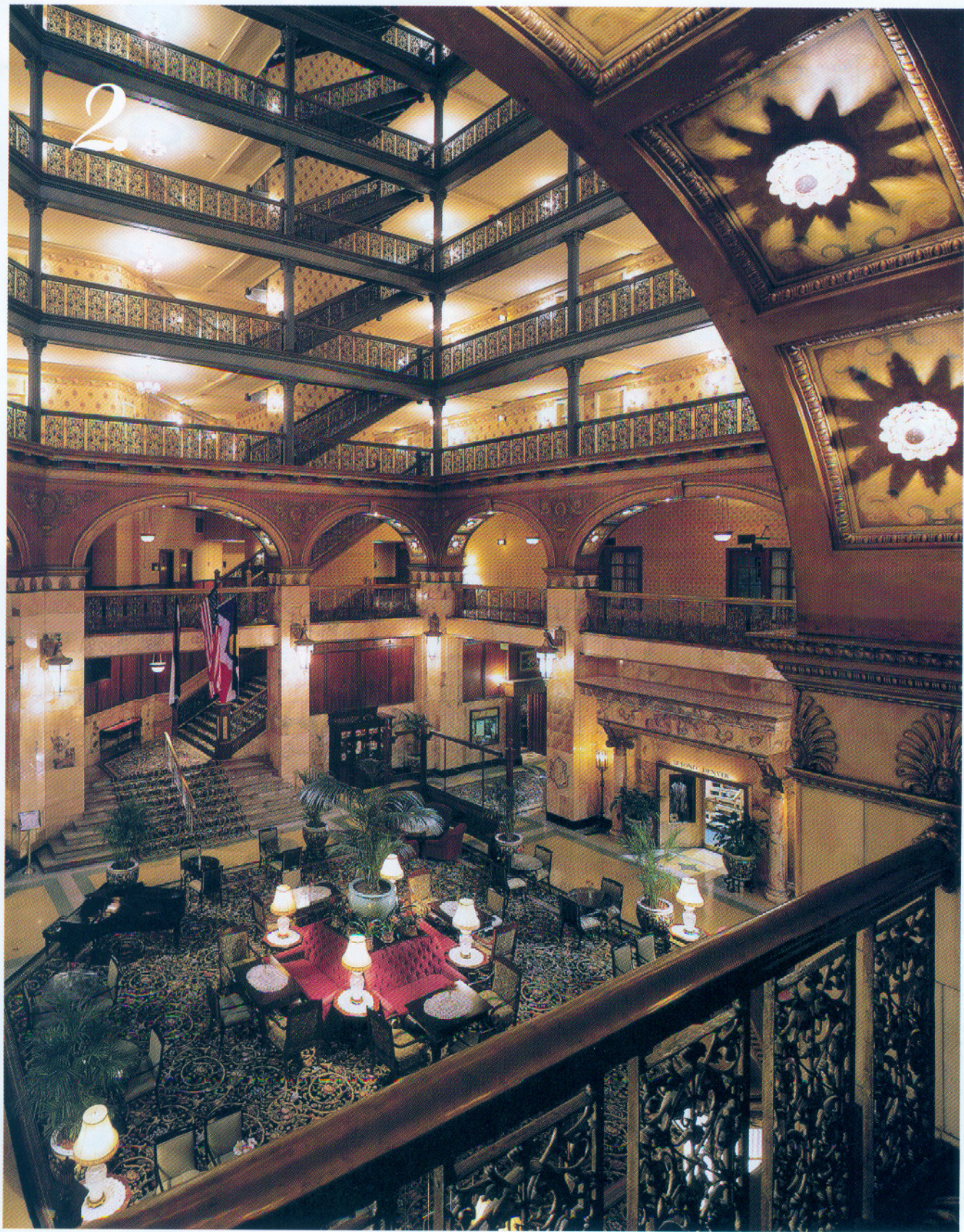
The Brown Palace Hotel, Denver, Colorado