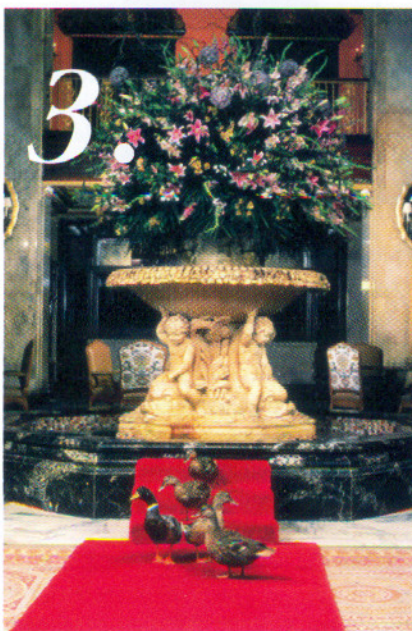
This Grande Dame's Just Ducky

For more information, call The Brown Palace Hotel at (800) 321-2599 or (303) 297-3111 or visit www.brownpalace.com .